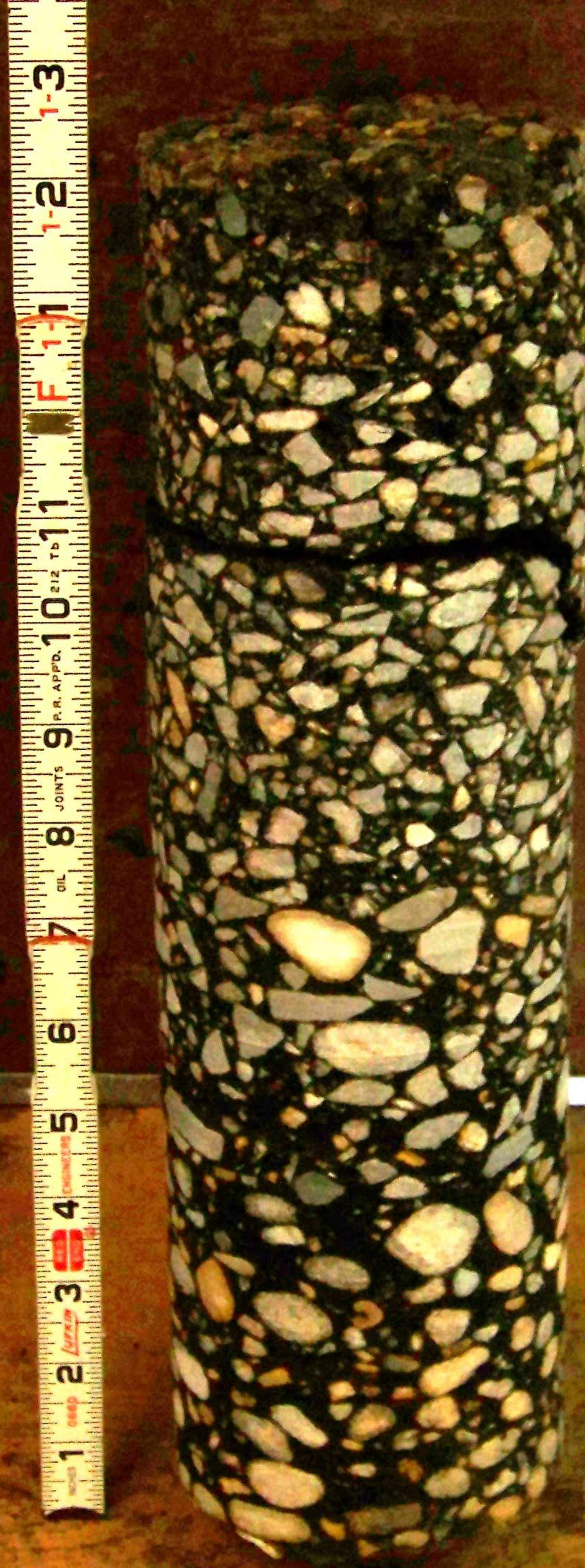
I-10 BALDWIN COUNTY CORE #11 EBOL M.P. 40.6 13.25" CRACK DEPTH 1.0"