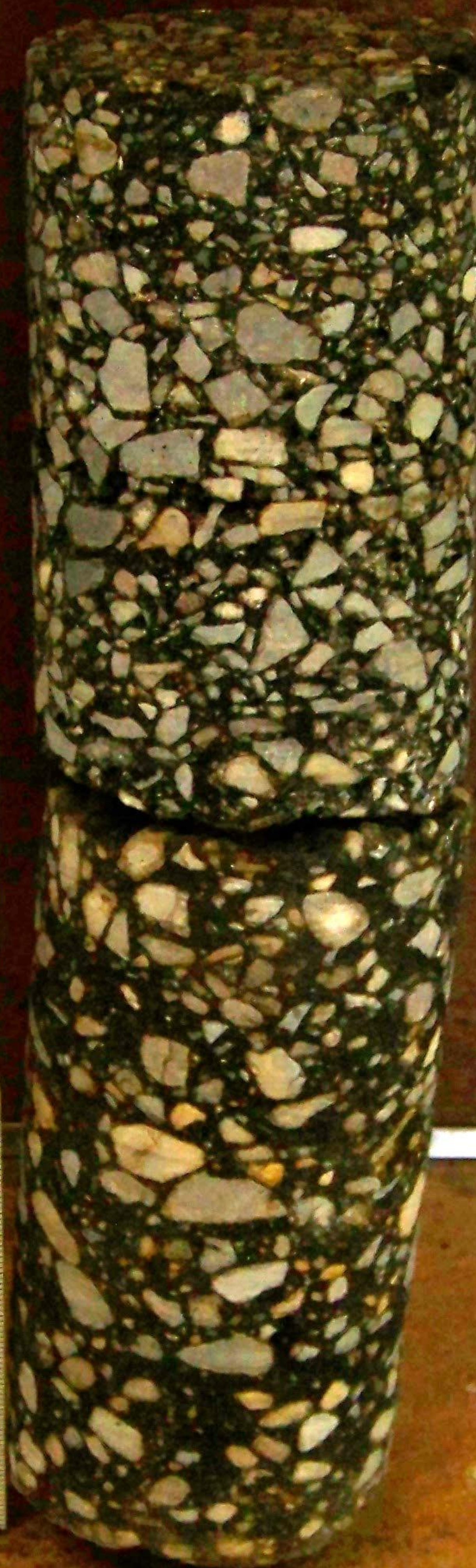
I-10 BALDWIN COUNTY CORE #18 EBOL M.P. 43.8 14.25"